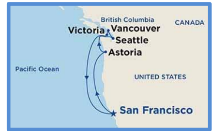
PORTS OF CALL