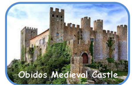
Obidos Medieval Castle