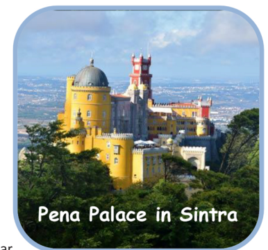
Pena Palace in Sintra