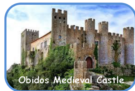
Obidos Medieval Castle