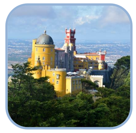
Pena Palace in Sintra