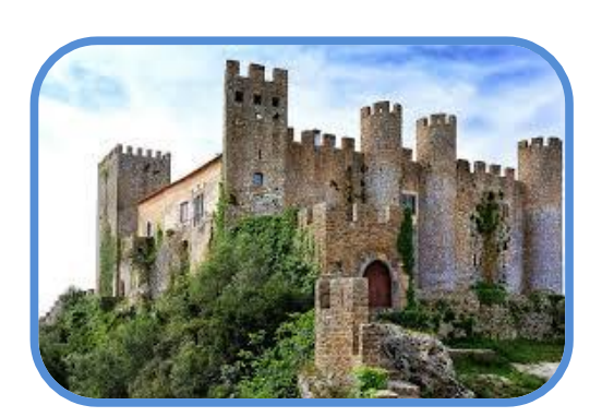
Obidos Medieval Castle