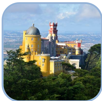
Pena Palace in Sintra