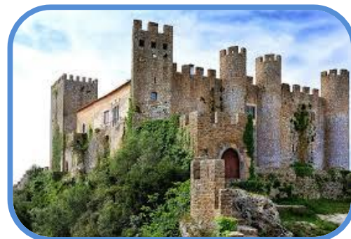
Obidos Medieval Castle