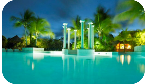
Grand Palladium White Sands Resort & Spa

PRICE: $1,990.00 perperson (double occupancy) Maximum number of participants is 45. Five Single Supplements are available at $626.00 each.