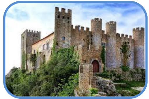
Obidos Medieval Castle