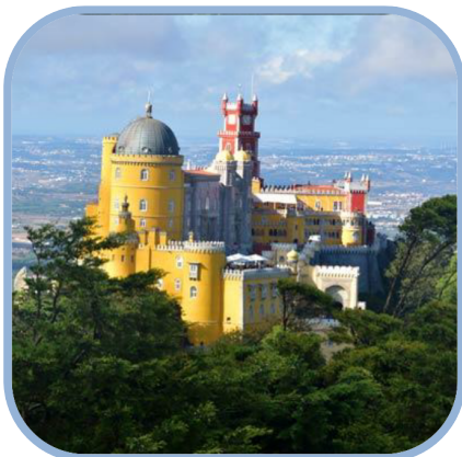
Pena Palace in Sintra