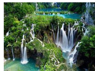
Plitvice Lakes National Park

Trip Insurance: The Springfield Ski and Travel Club strongly recommends at a minimum the purchase of trip insurance covering accident, sickness or death of a participant or covered family member that would result in cancellation either prior to or during the trip. Travelers are encouraged to purchase “Cancel for Any Reason” insurance if possible (be sure to compare coverage as some packages do not cover the full price of a trip). Your trip insurance should be purchased as soon as possible to ensure complete coverage.