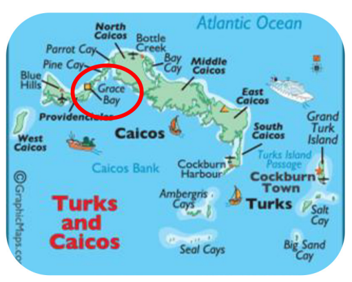
Located at Grace Bay