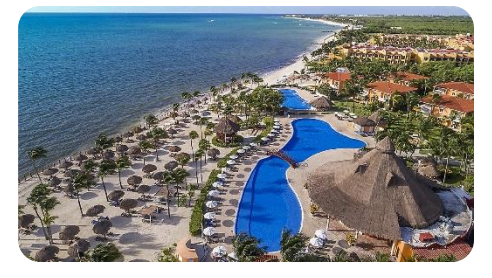
Ocean Maya Royale Riviera Maya, Mexico