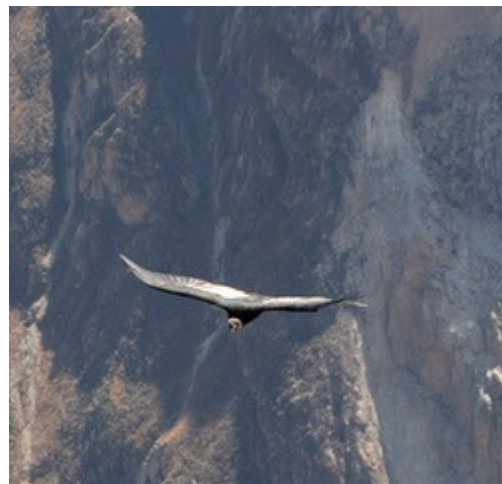
Peruvian Condor at Colca Canyon

On our final day we flew back to Lima in the morning, some free time in Lima and had a lovely farewell dinner before our 11:45 PM flight back to Miami & real life. What a fabulous trip with great group of travelers!!