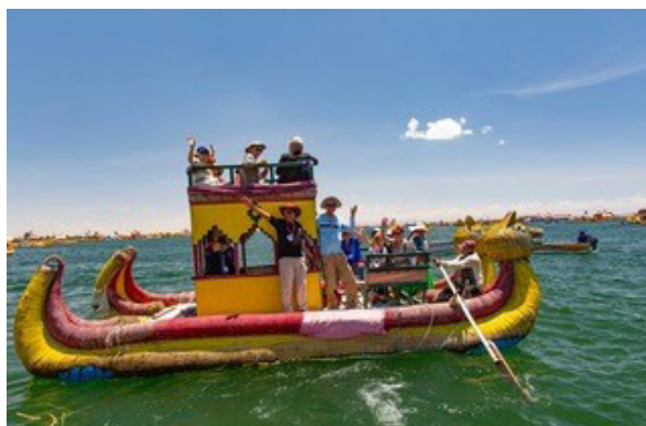
Reed boat at the Uros Islands on Lake Titicaca