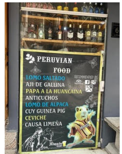
Our trip to the markets

In the morning we had a boat excursion on Lake Titicaca and the man-made reed floating Uros Islands. We visited two different islands with some of the group taking a traditional reed boat rowed by indigenous people in their native dress. On the islands we were shown how the islands were built and what life on the island was