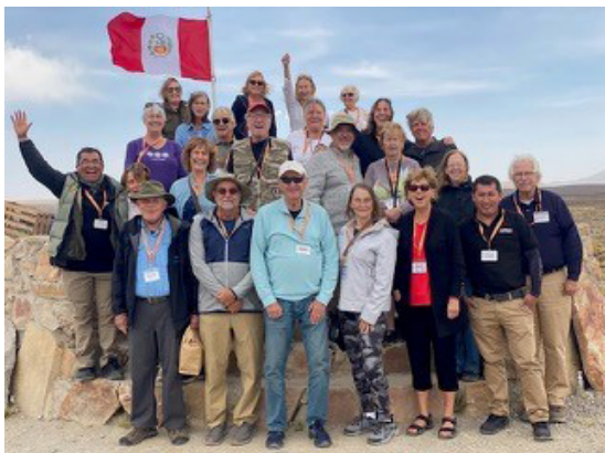
Routing for the Peruvian futbol team in the thermal baths, had a massage or a facial.

The next day found us at the Colca Canyon where Peruvian condors soar against the bright blue sky. Colca Canyon is the second deepest canyon in the world, much deeper than the Grand Canyon. Along with lots of other tour groups, people dressed in condor costumes, and a huge condor sculpture we did see 1 Peruvian condor.