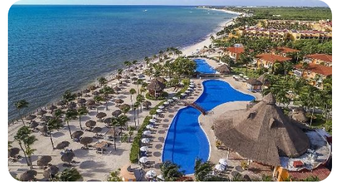
Ocean Maya Royale Riviera Maya, Mexico

PRICE: $1,800.00 per person (double occupancy) Minimum number of participants is 21, maximum is 30. Minimum age is 18. One Single Supplement is available at an additional $180.