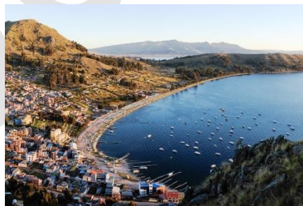
Lake Titicaca ◦

Day 7, Afternoon – See the Sillustani Tombs - $49/person